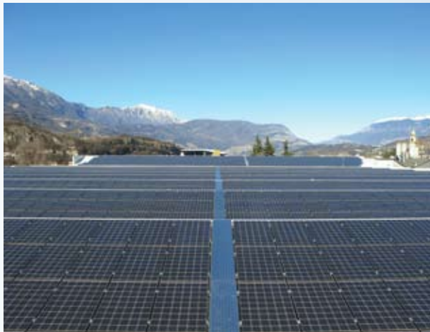
PV Plant in Rovereto (Trento): Tecno Spot supplied the material and handled the technical assistance during the planning process.

Today Tecno Spot is a fully-fledged industry leader in the Italian photovoltaic sector. It has a dedicated salesforce, able to serve the whole country, providing an excellent service for projects of any size,