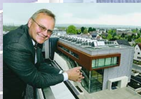
Office building with Schüco solar façade